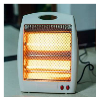
Portable space heaters