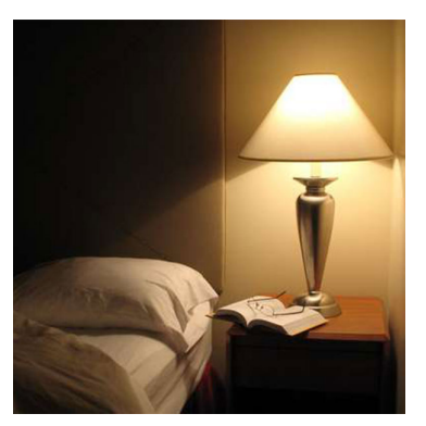
Poorly installed light fixtures