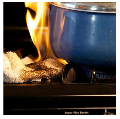
Cooking equipment – #1 cause of fire injuries

12,700 reported injuries. Property damage was estimated at $7.9 billion.