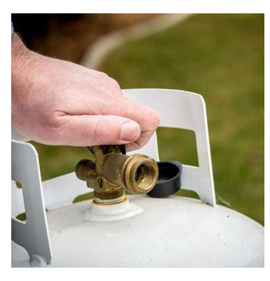
Propane and gasoline