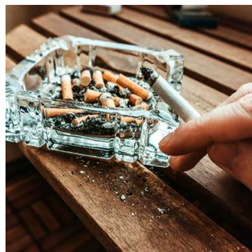
Smoking - #1 cause of deaths